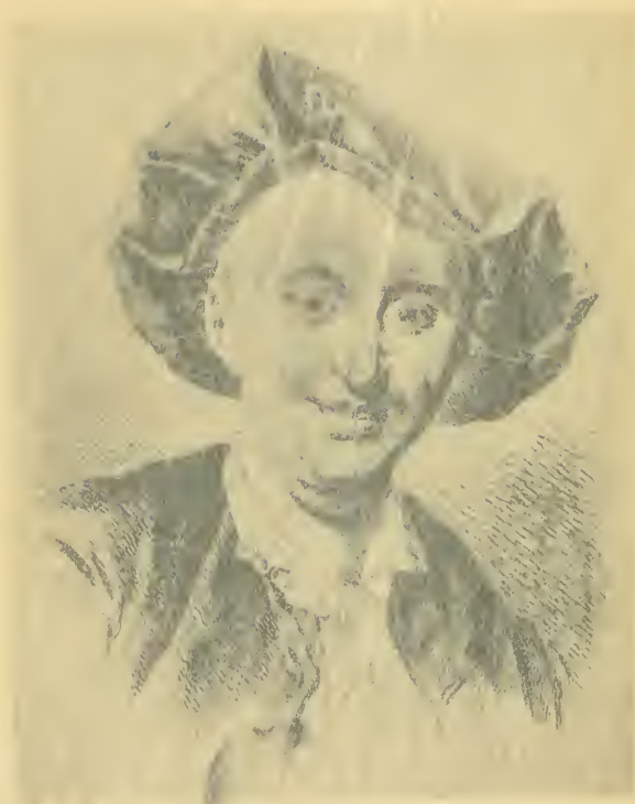
JULIEN OFFRAY DE LA METTRIE (1709-1751)